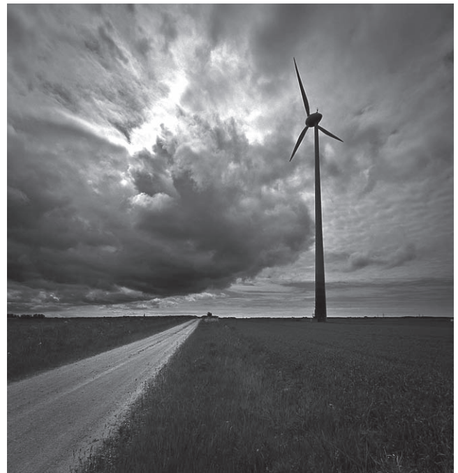
Wind turbine near Palanga, Lithuania.

lies in the breadth of the sustainable development agenda, which makes it very difficult to control and coordinate the member states' interests, as well as sectoral policy interests. In the absence of a solid common view on many of the details, instead of just adjusting its positions in the negotiations with the others, the EU has to negotiate its own contributions in parallel. This again puts a lot of pressure on Denmark, which is holding the Council presidency.