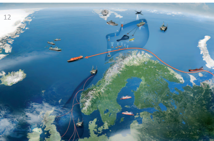
BalticWatch/BarentsWatch ILLUSTRATION: SINTEF