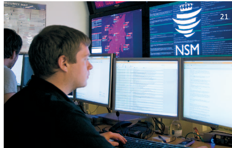
Norwegian National Security Authority

A Nordic resource network should be established to defend the Nordic countries against cyber attacks. Its main task would be to facilitate exchange of experience and coordinate national efforts to prevent and protect against such attacks and provide advice to Nordic countries that are in the process of building capacity in this area. In the longer term, the resource network could develop and coordinate systems for identifying cyber threats against the Nordic countries.