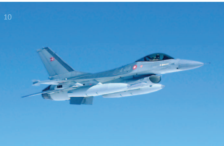
Danish fighter plane