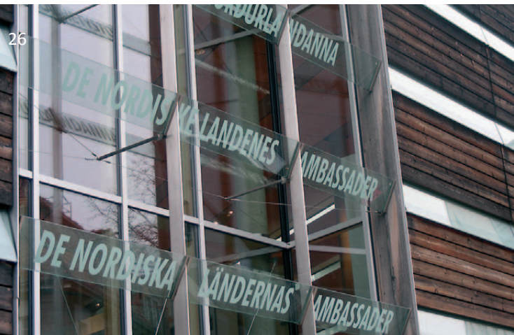
The Nordic embassy complex in Berlin