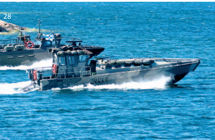
The Finnish-Swedish amphibious cooperation