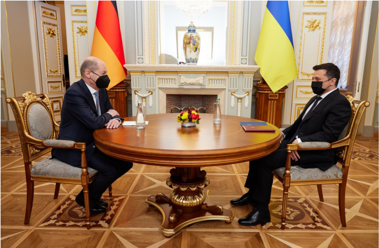
German Chancellor Olaf Scholz met with the President of Ukraine Volodymyr Zelensky in Kyiv on 14 February 2022.

Germany's lasting dependence on the import of Russian gas constitutes an additional key factor that has shaped the country's policy towards Moscow. The importance of Russian gas has even increased following the so-called Energiewende , namely the need for Germany to shift its energy balance towards greener and more renewable resources by improving energy efficiency. While the first Energiewende law was passed in 2010, the Fukushima nuclear disaster in March 2011 resulted in modifying the concept with the decision to shut down all nuclear power plants in Germany by 2022. Phasing out nuclear energy was, of course, set to increase the relative importance of natural gas in Germany's energy balance.